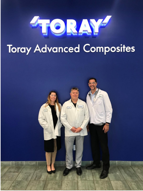
Toray Advanced Composites